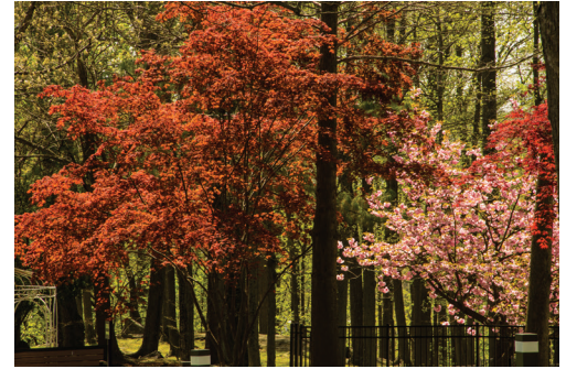
who took it while in New York at the GSC.

I really have had one of the more intense spiritual experiences in my life this week. I have gotten to watch the way AA creates its 'informed group conscience' and then also keeps an open mind and is able to change its own 'informed group conscience' based on minority opinion. After which we all came out of it with love and tolerance.